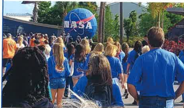
...and reaching solutions.