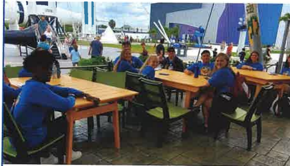
...while exchanging ideas