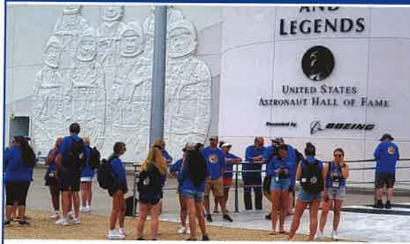
Having fun together...