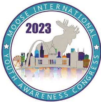
2023 International Youth Awareness Congress