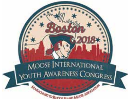
2018 International Youth Awareness Congress