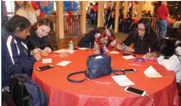
...and reaching solutions.

Activities & Heart of the Community Department Moose International Mooseheart, IL 60539-1183 (630) 859-2000 Fax (630) 966-2225