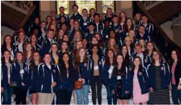
2018 International Youth Awareness Congress Winners