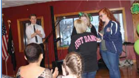
...while exchanging ideas