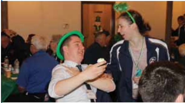
Having fun together...