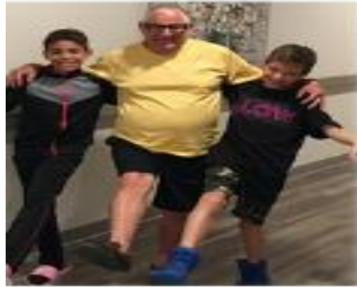
Make a Difference!