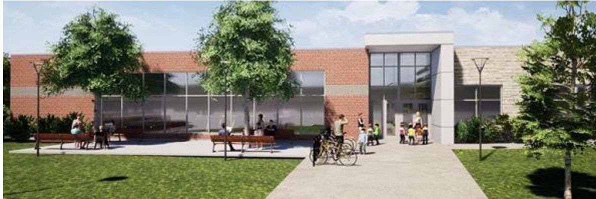
The Mooseheart Activity Center (MAC)